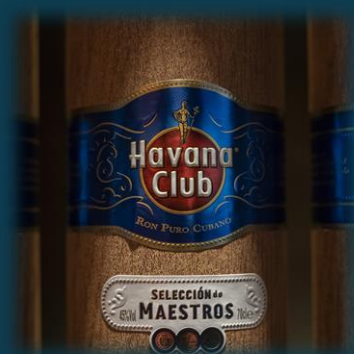
GIN AND RUM