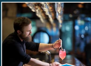
OPEN BAR & MENU