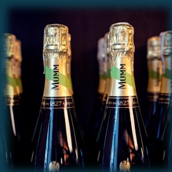
WINE AND CHAMPAGNE