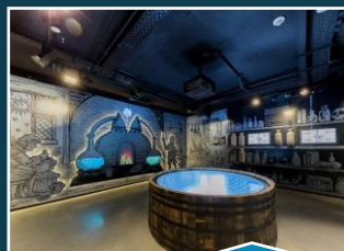
PVM TOURS & WORKSHOPS